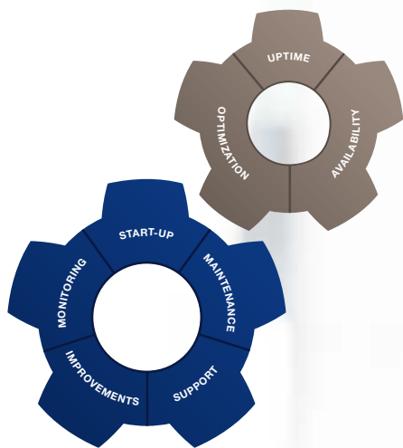
Alfa Laval 360° Service Portfolio

Alfa Laval has deep process and application knowledge, drawn from a vast experience for more than 130 years. You benefit from a long tradition of finding solutions for multiple applications worldwide.