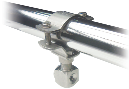
ZPM Metal clamps + PF Hollow cone nozzle