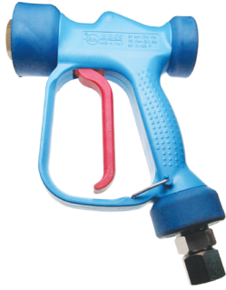
UMX 0020 T8