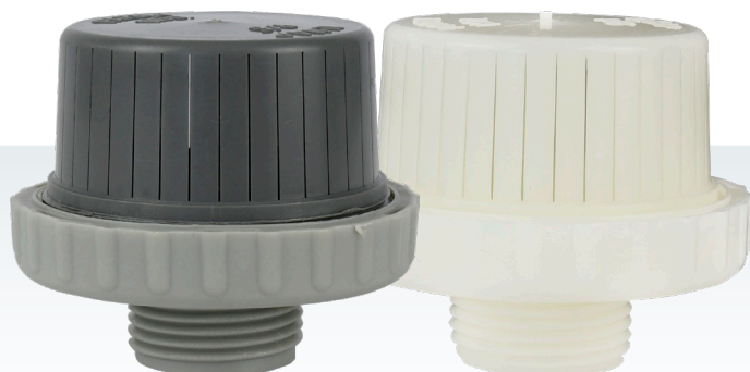
NOZZLE P5 - ID10