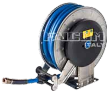
Spring side with guide hose arms in C position Lato molla con bracci guida tubo in posizione C

4R - Standard 4-rollers support on versions indicated in the table 4R - Guida tubo a 4 rulli di serie per le versioni indicate in tabella