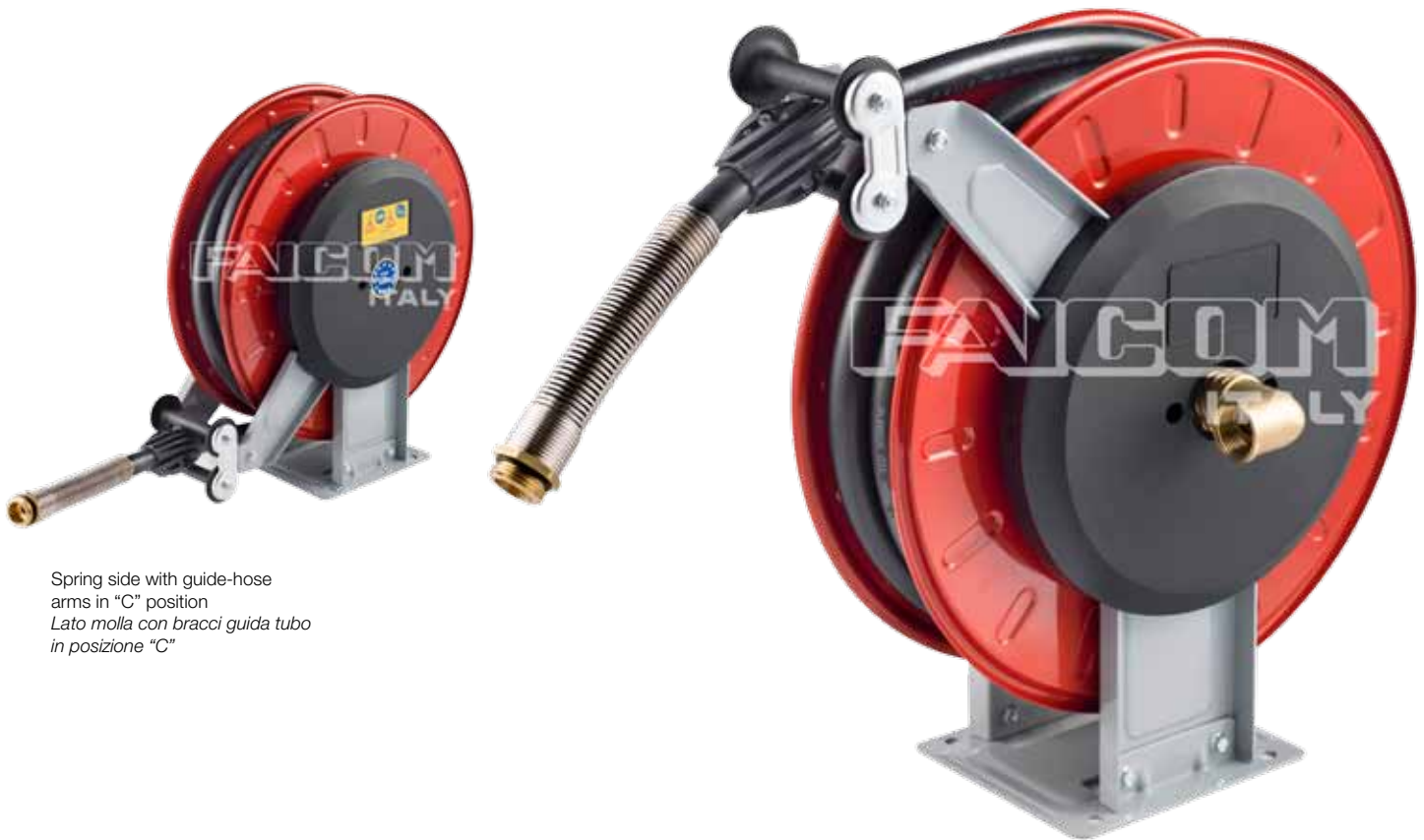
Spring side with guide-hose arms in "C" position Lato molla con bracci guida tubo in posizione "C"

EN Automatic hose reels suitable for the distribution of fluids such as diesel fuel, urea (AdBlue), air and water at different pressure and temperature conditions through hoses having a maximum diameter of 3/4". Hose-guide arms adjustable in three different positions according to the hose reel installation (pos. A-B-C). Standard: connection hose for the indicated versions, lateral protective covers. Optional: connection hose, revolving stand, fixing bracket.