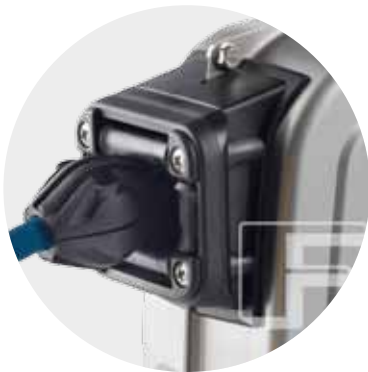
Standard: 4-rollers hose-guide Di serie: guida tubo a 4 rulli