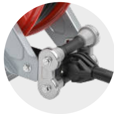
4R - Optional 4-roller hose guide. Ordering the version indicating the hose reel code followed by "4R" 4R - Guida tubo a 4 rulli opzionale. Ordinare la versione indicando il codice dell'avvolgitubo seguito da "4R"

EN Automatic hose reels suitable for the distribution of fluids at different pressure and temperature conditions. The parts in contact with the fluid have metal details and high-quality gaskets. Hose-guide arms adjustable in three different positions according to the hose reel installation (pos. A-B-C). Optional: connection hose, lateral protective covers (not available for mod. Atex), revolving stand, 4-roller hose guide, fixing bracket.