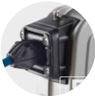
Standard: 4-roller hose-guide Di serie: guida tubo a 4 rulli

ordering the "ATEX" version indicating the hose reel code preceded by "EX" ordinare la versione "ATEX" indicando il codice dell'avvolgitubo preceduto da "EX"