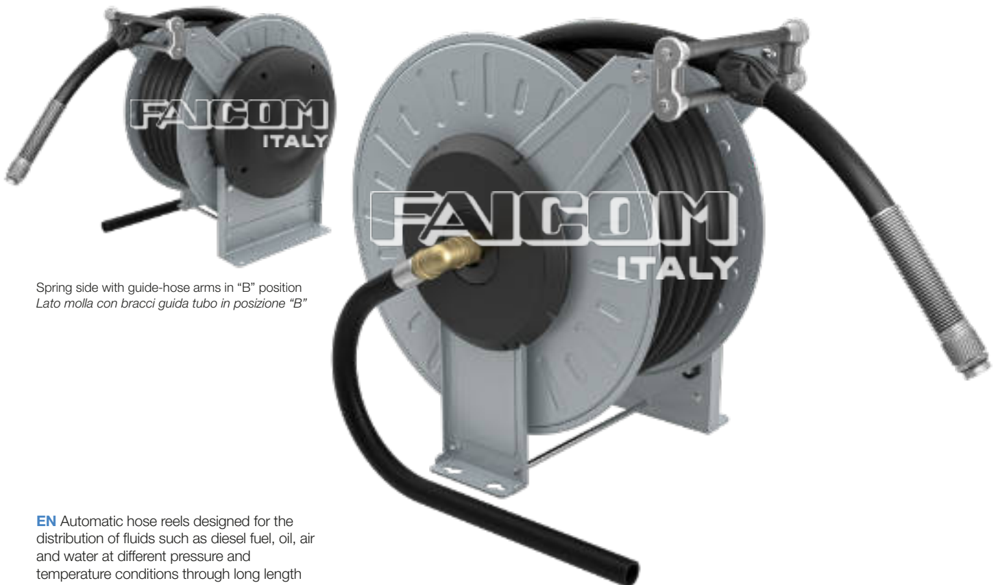
Spring side with guide-hose arms in "B" position Lato molla con bracci guida tubo in posizione "B"

ordering the "ATEX" version indicating the hose reel code preceded by "EX" ordinare la versione "ATEX" indicando il codice dell'avvolgitubo preceduto da "EX"